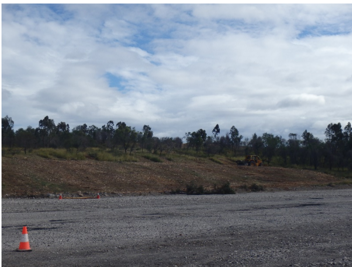
Figure 1 Mulcher on Cheshunt strip 24 before topsoil removal

It was observed that grubbing of the area had been completed to remove large trees and shrubs from the site (Figure 1). A mulcher was in operation on the groundcover along the strip for incorporation into the topsoil when stripped. This process was observed to be consistent with the process described in section 2.4.2.3 of the MOP.