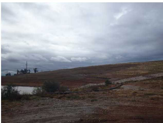
Figure 2 An area of Riverview North where topsoil was direct placed

HVO has identified that direct placement of topsoil was the preferred option when undertaking topsoil stripping operations and the site inspection identified several areas of rehabilitation have had direct placement of topsoil, for example, topsoil stripped from Riverview South was direct placed on Riverview North (Figure 2).