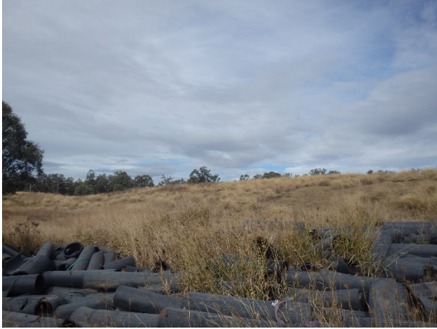
Figure 3 An older topsoil stockpile immediately adjacent to a pipe laydown area

No erosion or sediment controls were observed on any of the stockpiles inspected. Where stockpiles were well vegetated (for example stockpile 53), the erosion risk was low. For unstabilised stockpiles (for example stockpile 47), there was an increased risk of topsoil loss from erosion, although it was acknowledged that there wasn't any significant erosion or riling observed at the time of the audit.